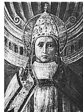
Modalism or Moodalism